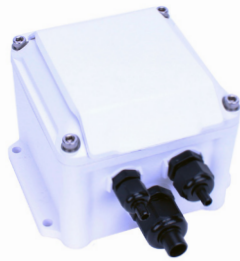
Optional Protective Cover Closed