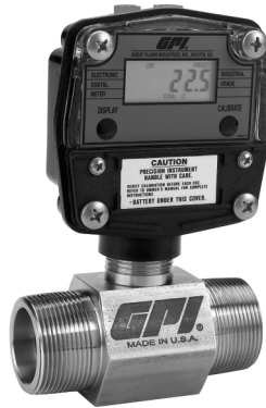
GNT Meter as a Complete Package