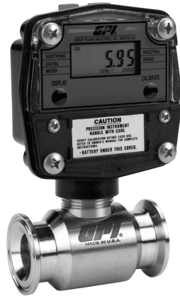
GSCP Meter as a Complete Package