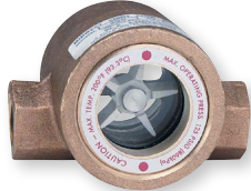
Model 300, 300MP ++