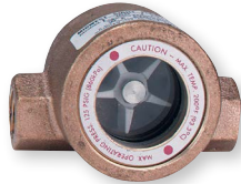
Model 100, 100MP ++